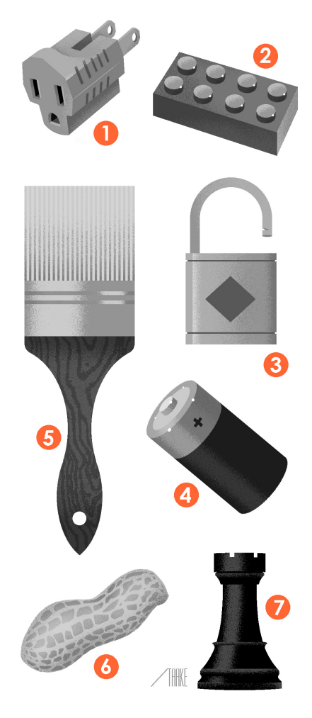
(Bob Staake for The Washington Post )

Picture 3: Starting in 2018, all cigarette lighters will be required to contain water faucets as a safety measure. (Bruce Niedt, Cherry Hill, N.J.)